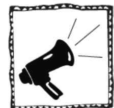
CALL TO ACTION