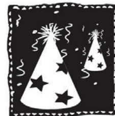
ACKNOWLEDGE / CELEBRATE

Event Methods: There are several facilitation methods and techniques that can help transform a traditional-style meeting into a spectacular, results-oriented action learning Pacing Event.