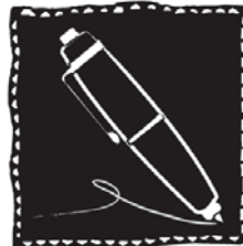
BUY-IN / ENDORSE