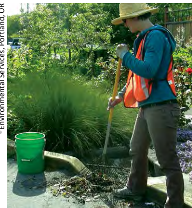
Figure 1. A worker removes sediment and debris from a curb-cut in a stormwater bump-out along a street in Portland, Oregon.