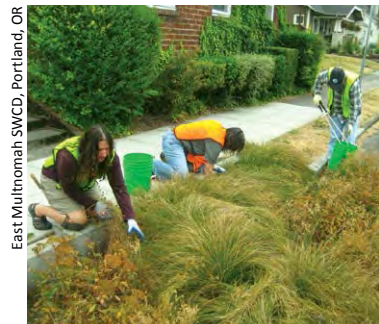
Figure 4. Volunteers with Portland's Green Street Stewards program care for a LID feature in their neighborhood by removing debris and weeding.