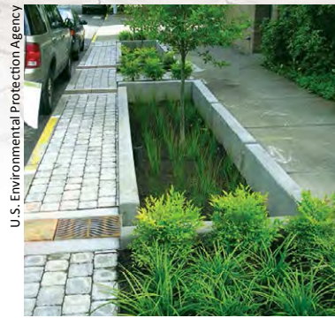
Figure 3. This stormwater planter is one of a suite of dispersed stormwater management practices that Portland, Oregon, city employees help to manage.

Education can improve maintenance of LID practices. In 2007 the North Carolina State University Cooperative Extension Service developed a 1.5-day stormwater BMP inspection and maintenance training program—since then, more than 1,250 local government officials, design professionals and landscape maintenance practitioners from across the United States have taken part (see www.bae.ncsu.edu/topic/lid/ ). For access to the most recent information on LID maintenance available, check www.epa.gov/nps/lid and www.epa.gov/greeninfrastructure .