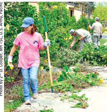
Figure 2. Soldiers with the U.S. Army in Hawaii help maintain a bio-retention area by trimming bushes and removing weeds.