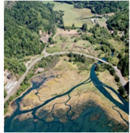
Natural and restored tidal wetlands in Tillamook Bay, OR.

In Puget Sound, EPA researchers are providing model results and/or training in the use of modeling tools for tribes and communities to identify best management practices for restoring terrestrial and estuarine habitats and mitigating potential climate impacts. For example, Nisqually Community Forest tribal and community partners are using VELMA results to help obtain grants to expand the Nisqually Community Forest in support of local jobs, recreation, and tourism. Seattle and other communities are engaged in model applications for identifying urban green infrastructure best practices for reducing toxic stormwater runoff responsible for high rates of coho salmon pre-spawn mortality in urban streams. 4