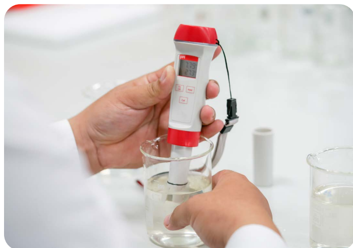
Figure 1: A pH meter.

Spilled oil can directly affect pH, as can the oil biodegradation process. Enhanced carbon dioxide formation resulting from biodegradation of chemically dispersed oil can lower water pH.