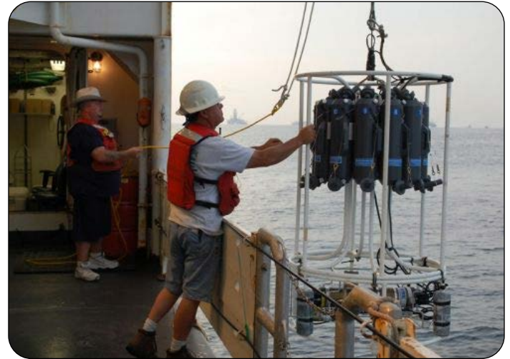
Figure 1: A CTD sensor package located at the bottom of the sampling rosette.

Conductivity-temperature-depth (CTD) instruments collect measurements of electrical conductivity (EC) by passing an electric current through a water sample (Figure 1). EC is then converted into salinity using a mathematical equation that compares the measured EC against known salinities. Conductivity is reported in microsiemens or millisiemens per centimeter (uS/cm or mS/cm). Salinity is reported in Practical Salinity Units (PSU), parts per thousand (ppt), or grams per liter (g/L), which are often used interchangeably.