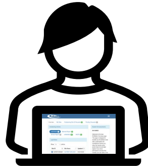
Registered Remote Signer