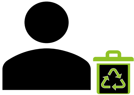
Unregistered field personnel