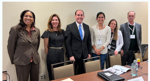
Federal panel at 2024 State Summit on Water Reuse in Denver, Colorado.