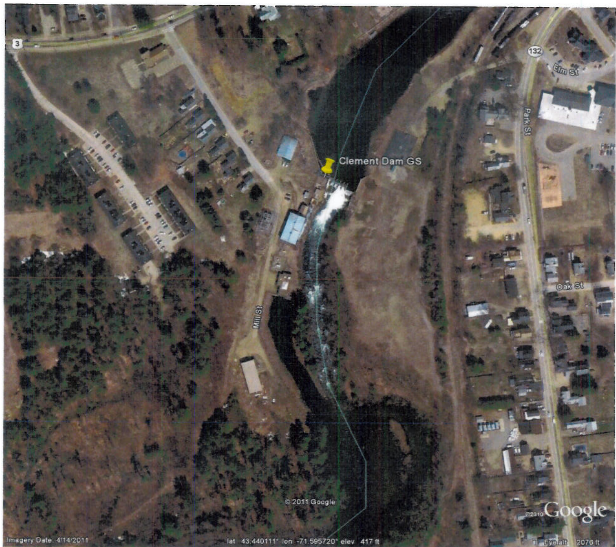
Clement Dam Generating Station – Site location map