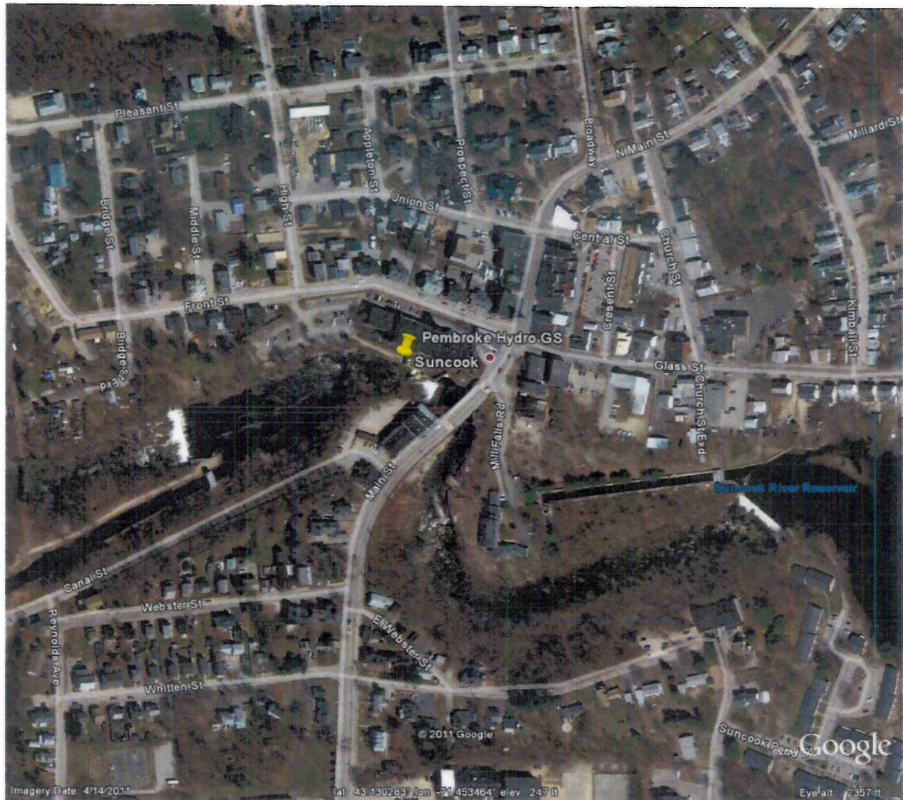
Pembroke Generating Station – Site Location Map