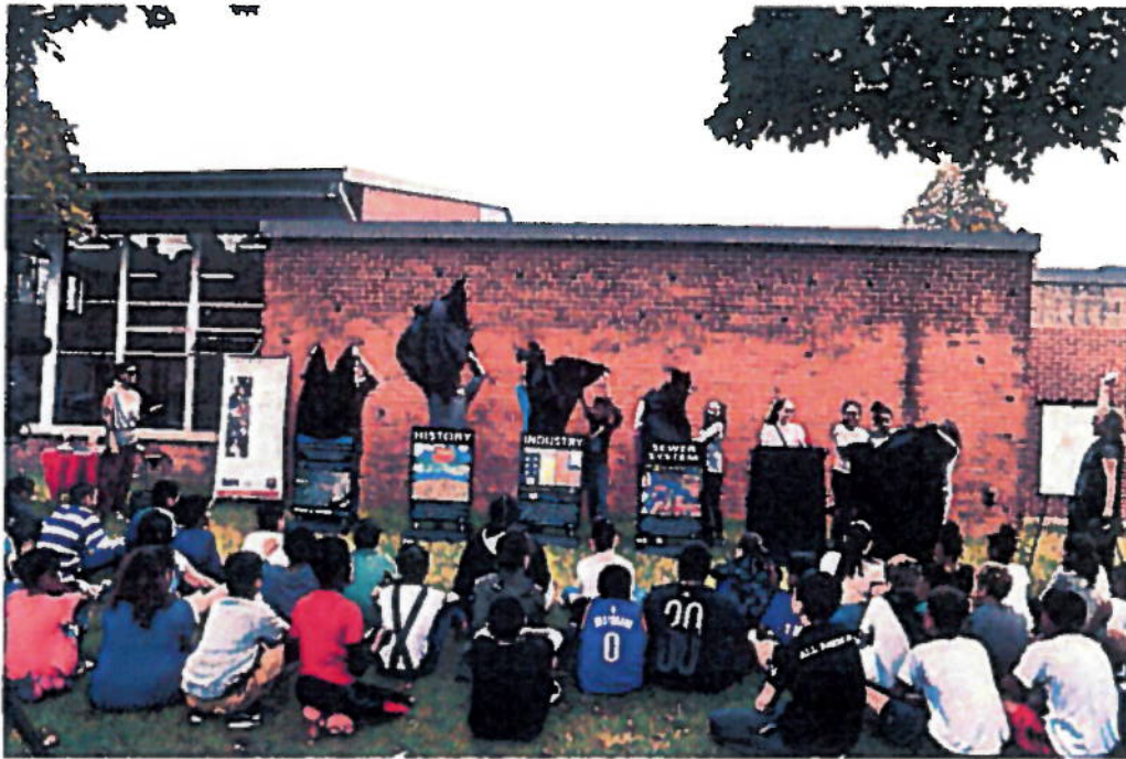
Students enjoyed the thrill of unveiling the Day Brook story walk at the Sullivan School in Holyoke. The story walk incorporated student artwork and words telling the history of Day Brook.

The mural, which relates the unseen journey of Day Brook in Holyoke, was unveiled at a ribbon cutting event at Community Field in June. The event for the mural included stormwater learning stations, including rain gardens in a cup activities. The storywalk unveiling occurred at the Sullivan School in September as part of Arts in Education Week. Students participated in the unveiling and then spent time being stormwater detectives on the school grounds, working in teams to check off items on a treasure hunt list. The story walk, conceived as movable artwork that tells the story of Day Brook in a series of six panels, has been installed for periods of time at the Sullivan School, Community Field, City Hall, and the Public Library.