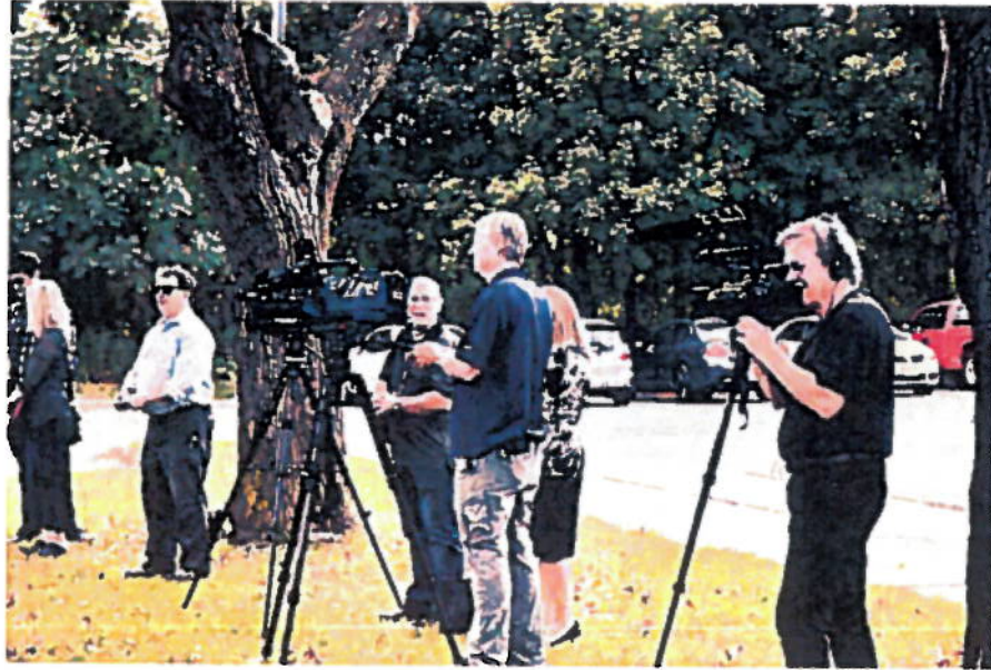
Local media provided good coverage of the story walk unveiling.